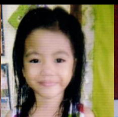
Princess Ale Birthday 11/19/2012 Nursery