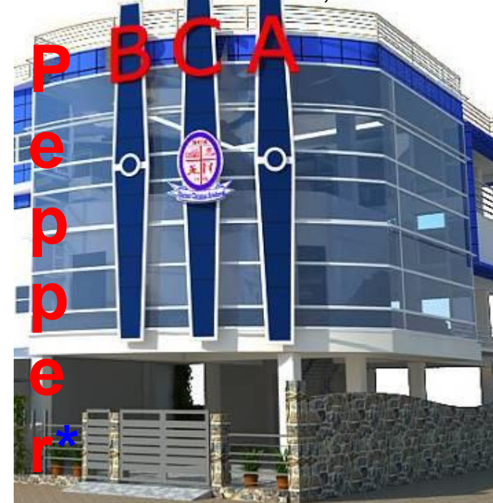
Artist’s rendition of BCA’s new addition, complete with 700-seat auditorium.

Paul M. Barner Ministries Philippine Church Planters, Vol 29 #2