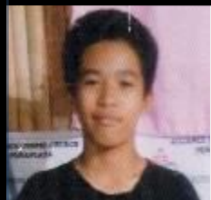
Rhail JRC Sasarita Birthday 02/09/2003 8 th Grade