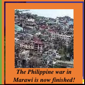
The Philippine war in Marawi is now finished!