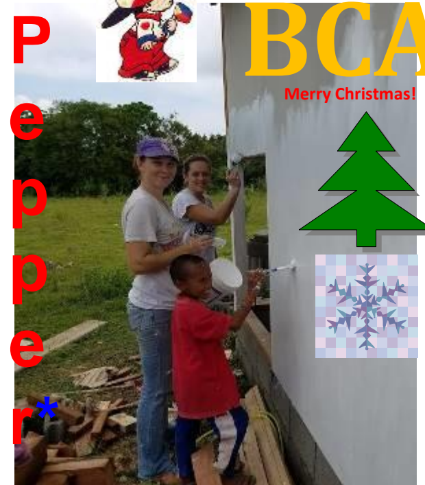
Arizona, USA missionaries work alongside BCA's street kids to build new cottages.