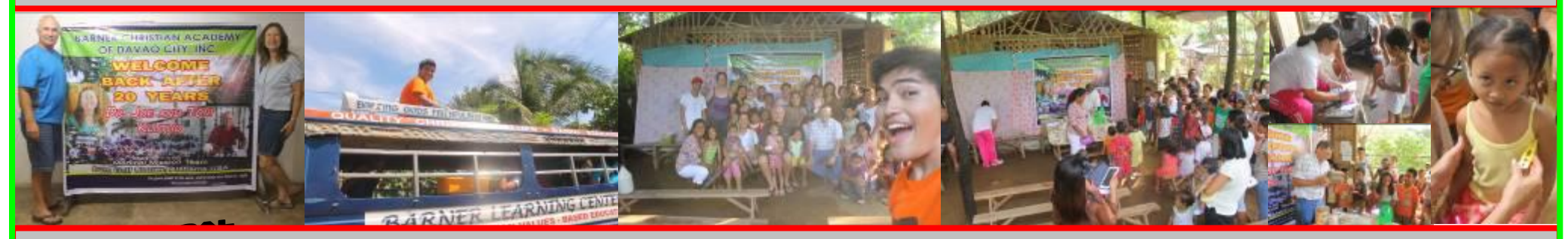
Wednesday: Barner Christian Academy (after our three-hour United Nations' children's presentations), (98 kids), Friday: Matina

<u>Total</u> # of children treated: 585 kids (8 sent to the hospital): <u>Sunday:</u> Boy's Orphanage: 11 kids //, <u>Monday:</u> Babak ( 81 kids & 2 hospitalized), Pinaplata ( 22 kids ), Kaputian ( 111 kids & 2 hospitalized), <u>Tuesday:</u> Agdao Father's House Girls' Home ( 5 kids ),