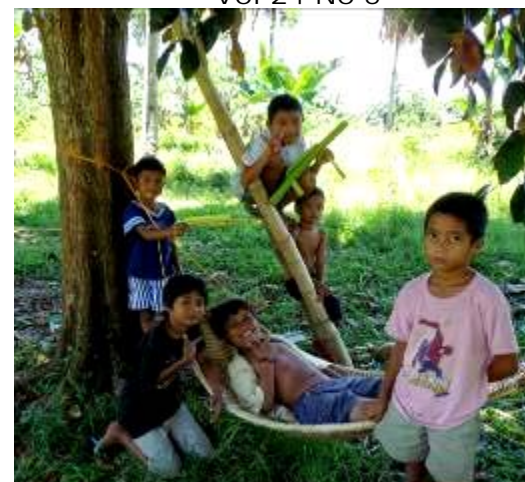
THE TEN ABANDONED STREET BOYS FROM OUR DROP-OFF CENTER ENJOY OUR BRAND-NEW FOUR-ACRE "FATHER'S HOUSE" BOY'S RANCH.