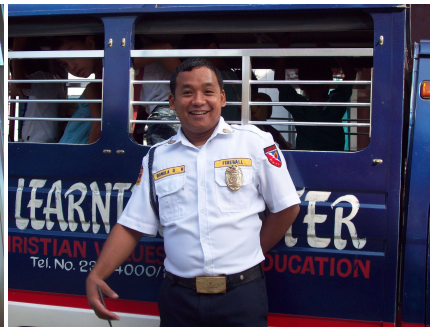
IN THE PHILIPPINES, OUR THREE ARMED GUARDS PROTECT THE SEVEN BLC BUSES & BUILDINGS 24-7, AROUND THE CLOCK.