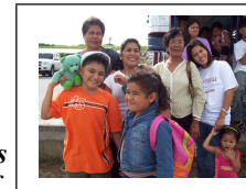
1-AIRPORT GOODBYES 2-PJ & THE BANKER 3-NEW MISSIONARY RECRUITS!

...you see signs on the side of the road, some reading “Stock Pile Ahead” and others, “Stock File Ahead”