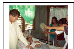
BEFORE LEAVING DAVAO, WE PERFORM A WEDDING AND PRAY FOR THE SICK