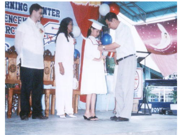
A PROUD DAD PINS THE RIBBON OF HONOR ON HIS DAUGHTER'S TOGA. SHE IS THE VALEDICTORIAN OF BLC, "BATCH 2008"!