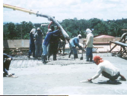
WE ARE STILL LACKING OVER $7000 FOR THE LIBRARY'S INTERIOR, SO WE'LL RENNOVATE BIT BY BIT.