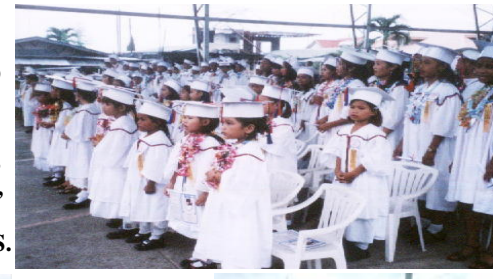
IN CAPS AND GOWNS, MOST 6TH GRADE GRADUATES ARE FINISHED WITH SCHOOL FOR LIFE.