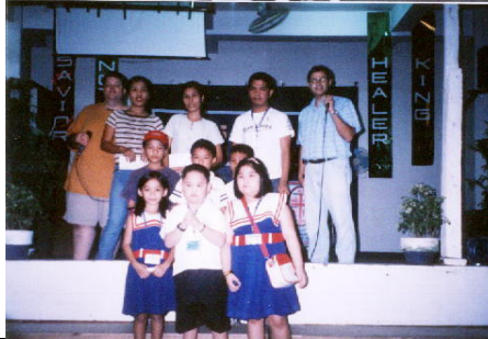
9 CHAMPIONS OF BLC'S 2007-8 BIBLE BEE MEMORIZATION COMPETITION RECITED DOZENS OF VERSES FOR GRAND PRIZE.