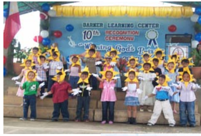
THE BLC PRESCHOOLERS GET INTO THE ACT AT GRADUATION CEREMONIES, AS THEY SING, DRESSED UP LIKE FLOWERS.