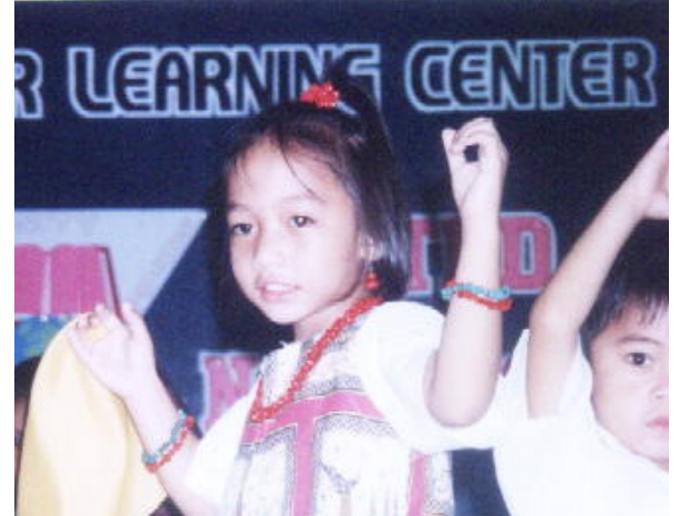
A BARNER LEARNING CENTER PRESCHOOLER DANCES TO FILIPINO PRAISE MUSIC DURING OUR ANNUAL UNITED NATIONS DAY.

Paul M. Barner Ministries Philippine Church Planters Vol 19 No 12